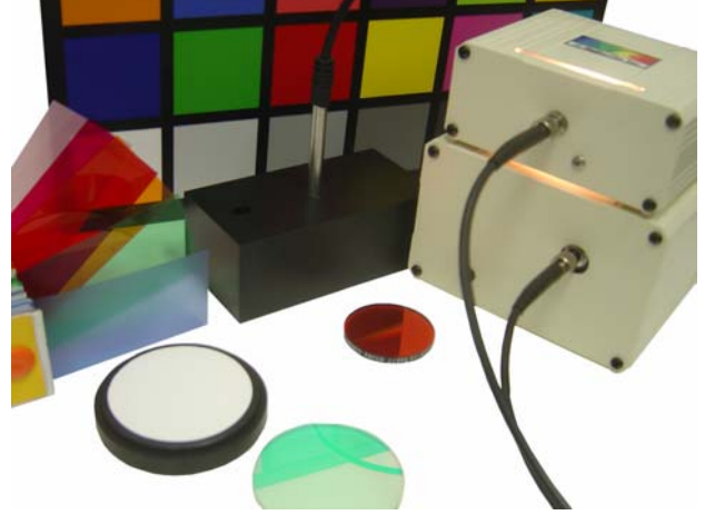
Reflectance Probe & Light source