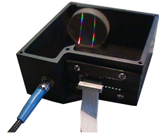
High performance spectrocolorimeter has internal concave grating spectrograph optics with no mirrors or adjustments