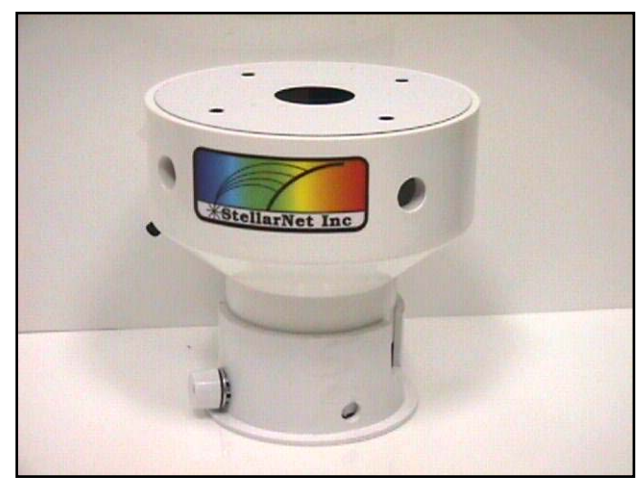
RFX Reflectance fixtures have integrated halogen light source to make color measurement easy by placing samples on top