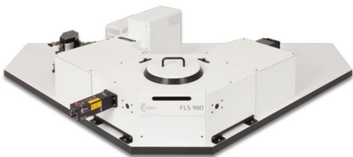
FLS980 Photoluminescence Spectrometer

Luminescence temperature measurements were performed using an FLS980 Photoluminescence Spectrometer equipped with double excitation and emission monochromators in L geometry, a photomultiplier tube detector (PMT-900) and a 450 W Xe lamp. Gratings blazed at 250 nm were used in the excitation and at 400 nm in the emission arm, with higher diffraction orders being filtered by the integrated long wave-pass filters in the FLS980.