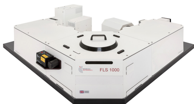
FLS1000 Photoluminescence Spectrometer

Persistent luminescence, commonly called afterglow, is characterised by long-lasting visible emission over several hours after ultraviolet excitation. This finds wide applications in glow-in-the-dark signage and in-vivo imaging for disease diagnosis and treatment. However, biological tissue allows transmission of near-infrared (NIR) light shorter than 1400 nm due to absorption by water and lipids. 1 The majority of bio-imaging applications utilises the 700 nm-950 nm window. 2-4