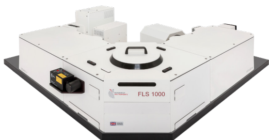
Figure 1. FLS1000 Photoluminescence Spectrometer

The measurement of fluorescence lifetimes provides a wealth of information on the sample under study, from charge-carrier lifetimes in semiconductors to the local environment of biomolecules in living cells. In many of these studies, short fluorescence lifetimes on a picosecond timescale are required to be measured. In this application note, the measurement of sub 20 picosecond lifetimes utilising the FLS1000 Photoluminescence Spectrometer equipped with a hybrid photodetector is demonstrated, and the impact that the configuration of the FLS1000 has on the minimum lifetime that can be measured is discussed.